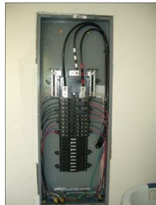
Typical Panel Upgrade