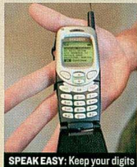
SPEAK EASY: Keep your digits

But not all parties involved may get what they bargained for. Consumers seeking greener call-rate pastures are likely to find sales staffs overwhelmed with questions about the policy. They could also encounter high charges for switching, as carriers try to pass on the $1 billion they spent adapting networks. (Sprint PCS and AT&T Wireless are already adding small monthly charges to all customers.) The carriers themselves could face an avalanche of defections. One of the few models is Hong Kong: