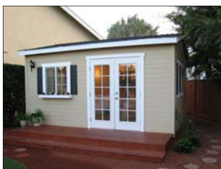
12x16 Studio... San Jose