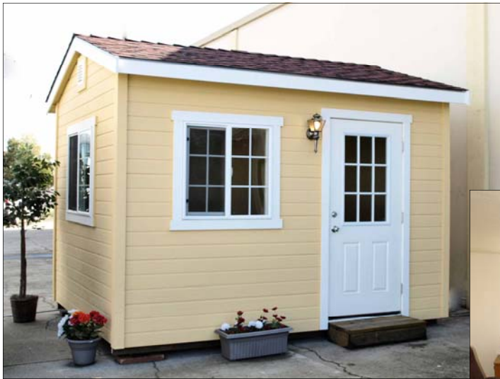
Typical 10x12 Studio