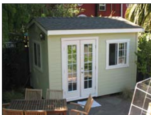
8x12 Studio... Oakland