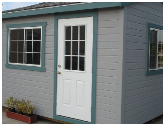
9-Light Door $455