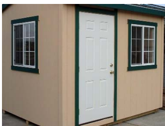
6-Panel Door $355