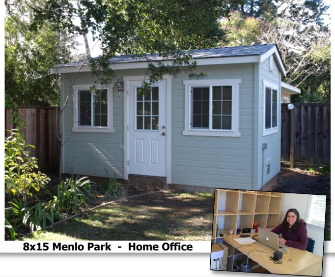
8x15 Menlo Park - Home Office