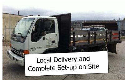
Local Delivery and Complete Set-up on Site