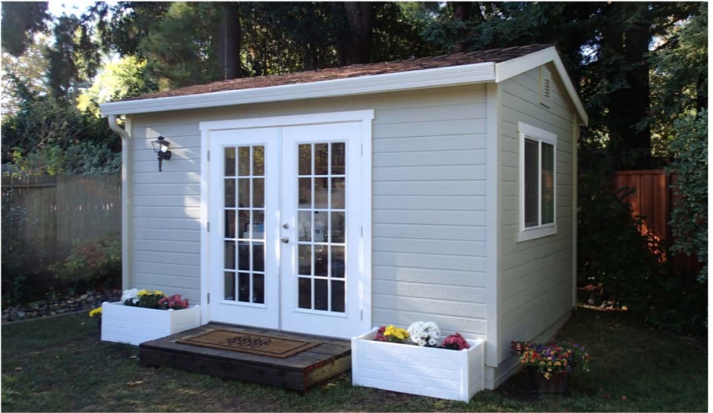
10x14 Studio with French Door*

Ideal for... Home Office Art Studio Exercise Room Music Studio Hobby Room Playhouse Game Room ...and many other uses!