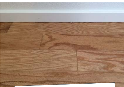
Natural Oak Finished Flooring (light or dark) & Baseboard