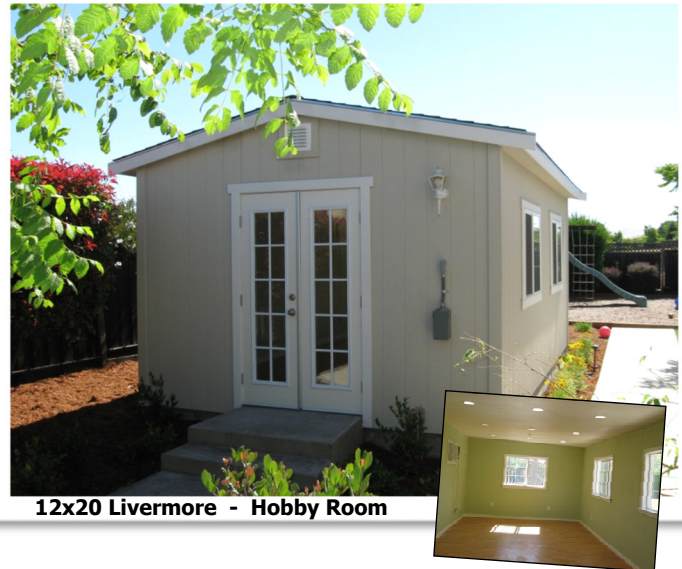
12x20 Livermore - Hobby Room