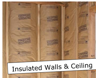
Insulated Walls & Ceiling

Includes all "Studio" features shown here