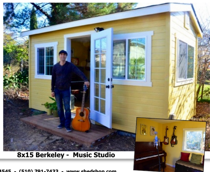
8x15 Berkeley - Music Studio