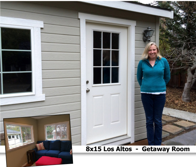
8x15 Los Altos - Getaway Room