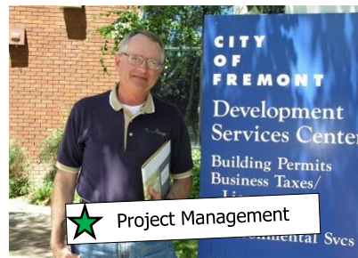
★ Project Management