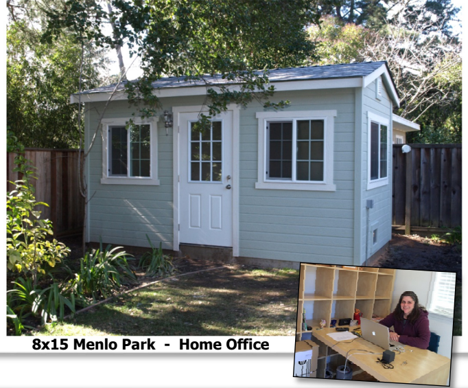
8x15 Menlo Park - Home Office