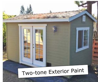
Two-tone Exterior Paint