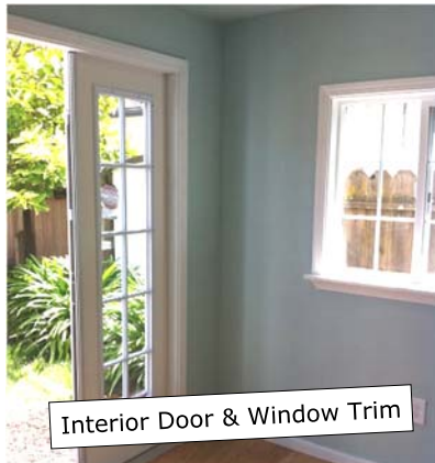
Interior Door & Window Trim