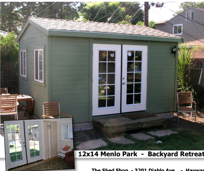
12x14 Menlo Park - Backyard Retreat