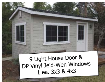
9 Light House Door & DP Vinyl Jeld-Wen Windows 1 ea. 3x3 & 4x3