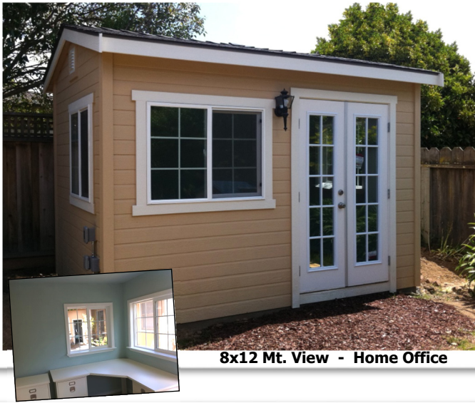
8x12 Mt. View - Home Office