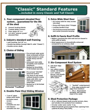
Most "Classic" model features included Plus...