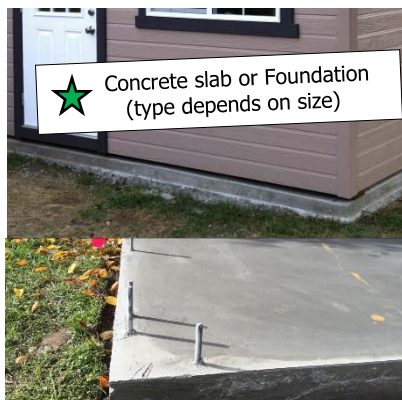
★ Concrete slab or Foundation (type depends on size)