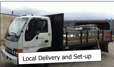
Local Delivery and Set-up