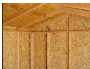
Uses "green" materials