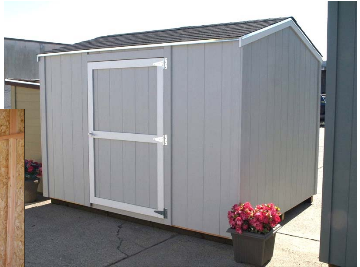
Typical 8x10 Rustic