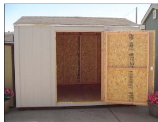
Extra-Wide shed door