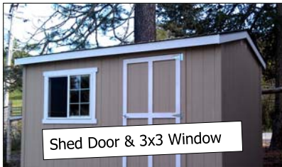
Shed Door & 3x3 Window