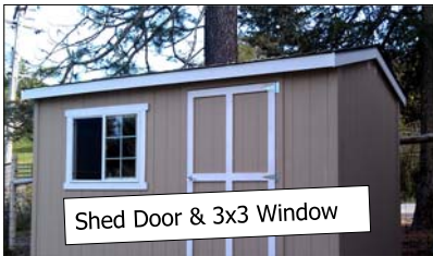
Shed Door & 3x3 Window