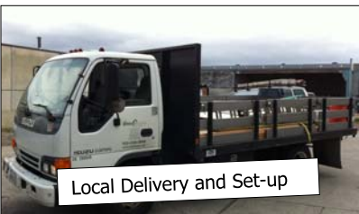
Local Delivery and Set-up