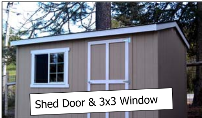
Shed Door & 3x3 Window