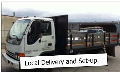
Local Delivery and Set-up