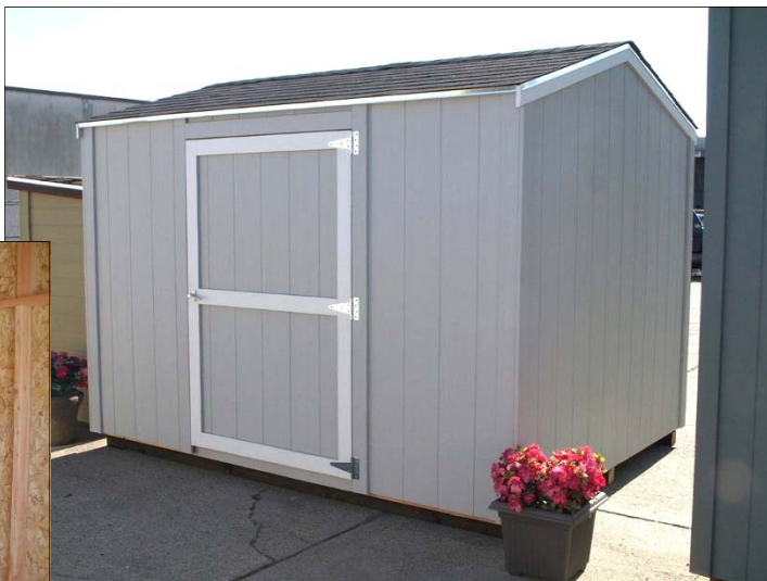
Typical 8x10 Rustic