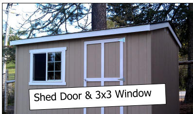
Shed Door & 3x3 Window