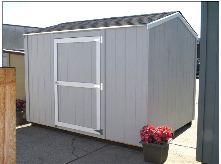
Typical 8x10 Rustic