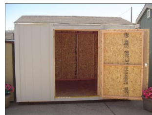
Extra-Wide shed door