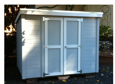
44 inch opening 60 inch opening Extra "shed" door