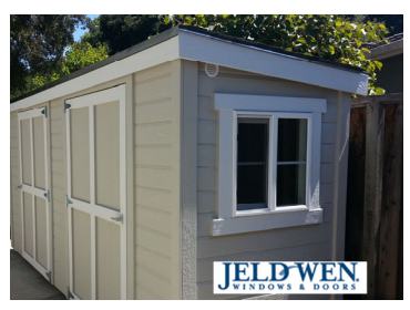
Jeld-Wen Vinyl Double Pane Slider with Grids