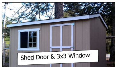
Shed Door & 3x3 Window