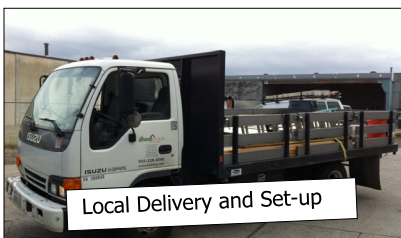
Local Delivery and Set-up