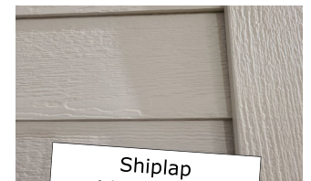
Shiplap with Sheathing