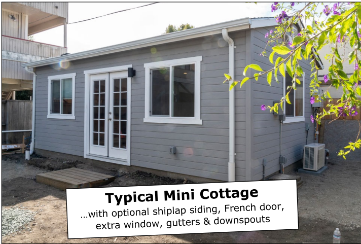
Typical Mini Cottage ...with optional shiplap siding, French door, extra window, gutters & downspouts