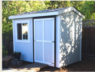
Shed Door & 3x3 Window