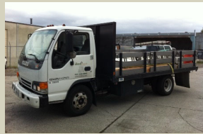
Local Delivery and Installation